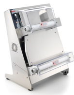
P_Roll 420 RP