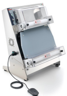
Optional pedal control