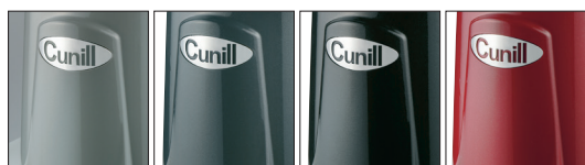
GREY DARK GREY BLACK PURPLE