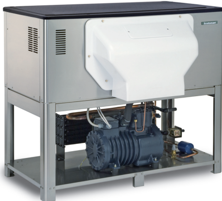
ABS Ice Chute Covermar: sold separately.