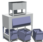
MAR 306+ITS3250 (sold separately)