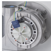
Gear box protection (hall effect)