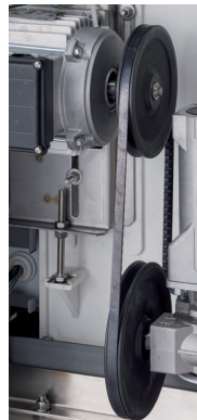
Pulleys & belt system allows to modify ice thickness