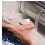
Easy to remove water sump