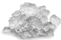
MF 47 Superflake ice Residual water content 15%