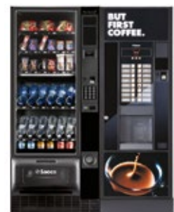
Artico L + Oasi 600