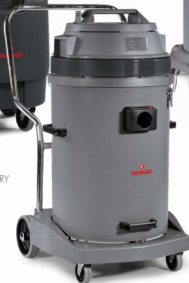
CA P58.4 WDB Tank capacity: 77 l Professional WET & DRY Suction: 2 motors