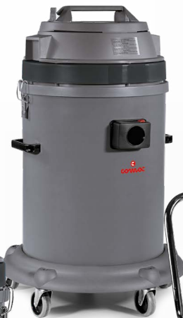
CA P58.3 WD Tank capacity: 77 l Professional WET & DRY Suction: 2 motors