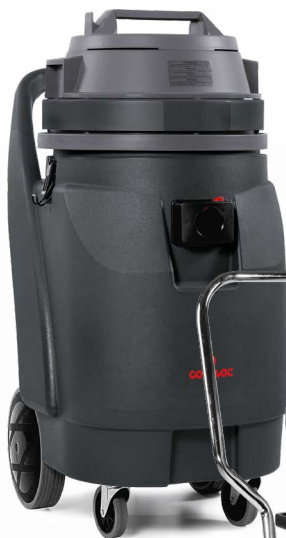
CA 110.2 Tank capacity: 110 l Professional WET & DRY Suction: 2 motors