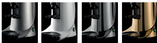
GREY METALLIC SILVER SNOW WHITE CHROME SILVER CHROME GOLD.