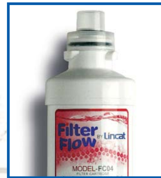
High capacity filter cartridge

The unique predictive eco mode learns from your usage and switches automatically to eco mode during quieter periods. Full operating capacity is restored when demand picks up.